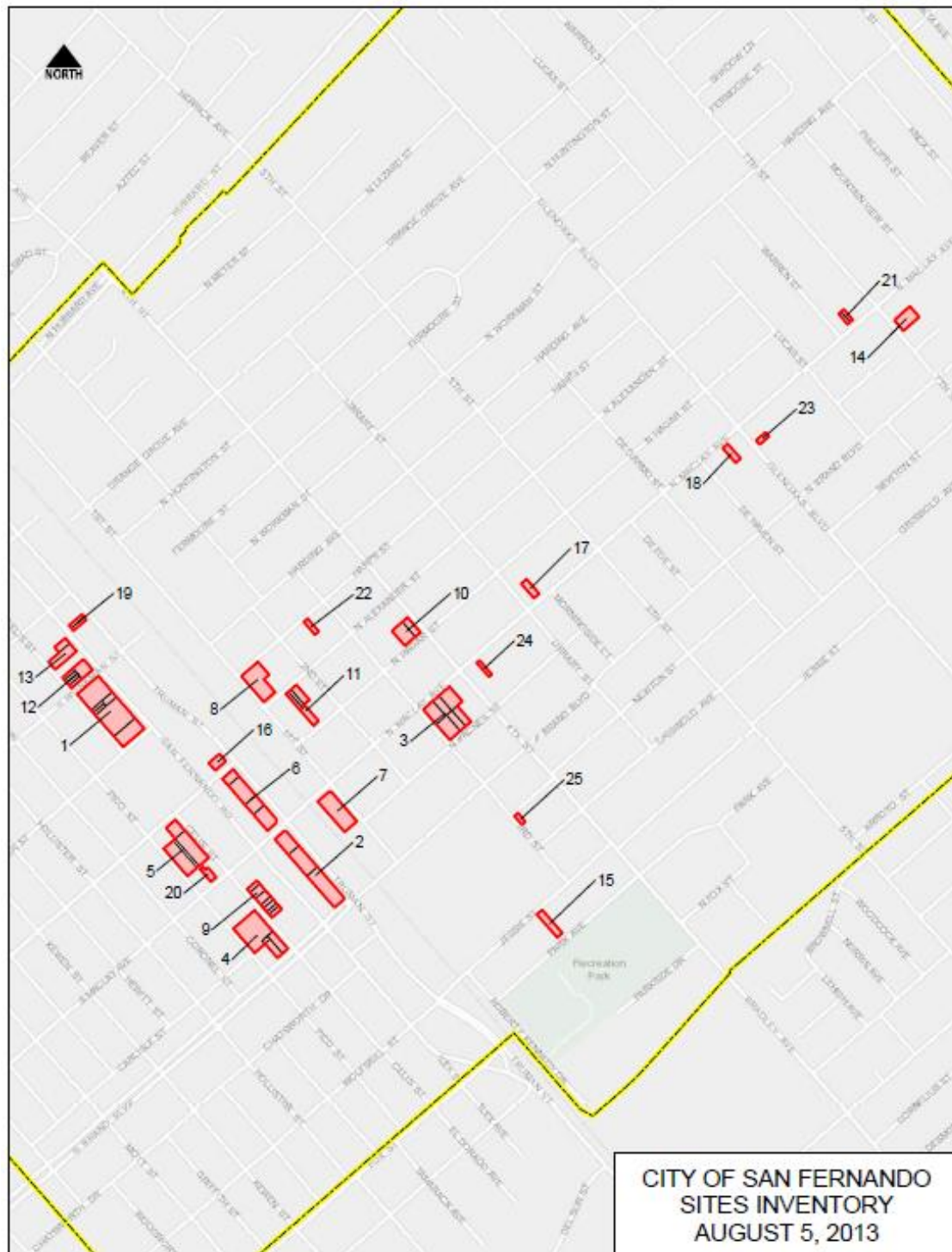
Figure 3: Residential Land Inventory