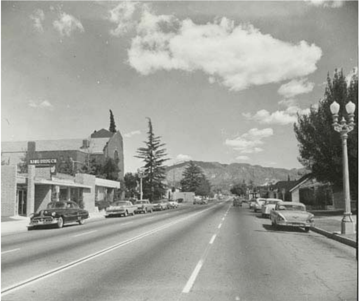
Maclay Avenue looking northeast towards the San Gabriel Mountains, 1962

The automobile allowed residents to move around the San Fernando Valley in new ways, spurring additional residential development. Craftsman and period revival became prevalent architectural styles in new neighborhoods. Interest in California's heritage continued to grow during this period, and the San Fernando Mission, a part of the territory annexed to the City of Los Angeles, was declared a State Historic Landmark on January 11, 1935.