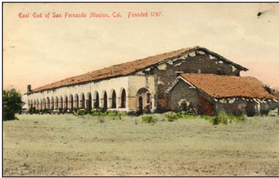
San Fernando Mission